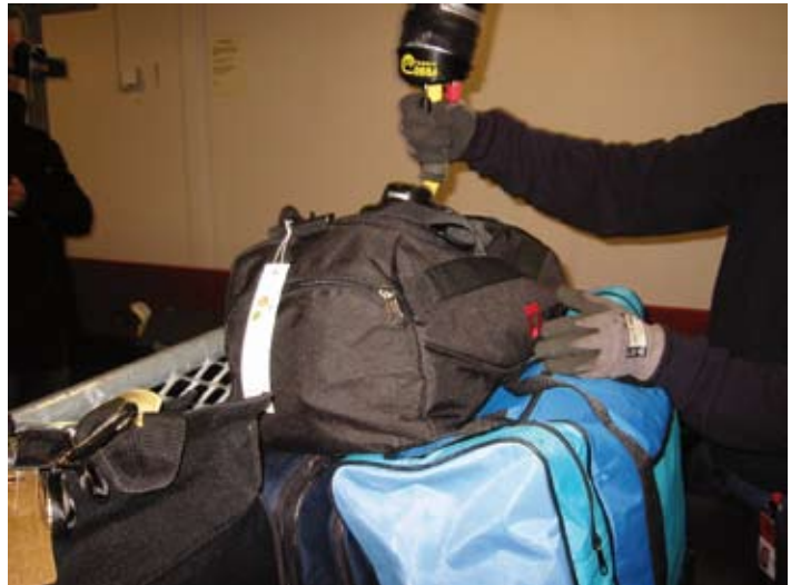
Designed for high-frequency lifting

The common goal must be to reduce the risk of injury from hazardous manual handling, so far as is reasonably practicable.